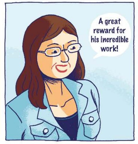
*The Abel Prize is the equivalent of a Nobel Prize for mathematics.